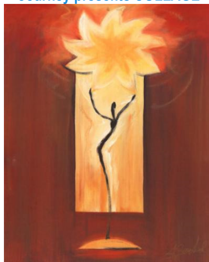
Collage: The All City Dance Experience